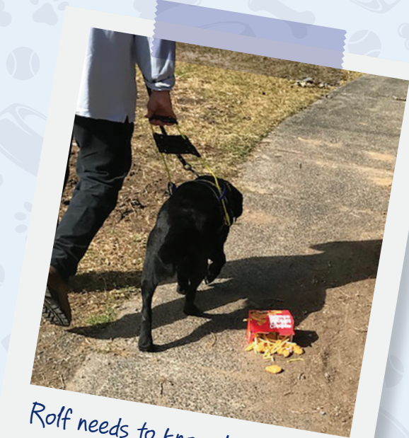
Rolf needs to know I can keep my concentration. Look how calm and controlled I am walking past this tempting food!